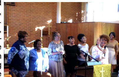
Fresh Start Bible Church Choir

The audience included a diversity of ages, ethnicities, and faiths. Admission was free, but donations exceeded $350 to support the All Saints Ascension food pantry in making the holidays a little more merrier for those in need.